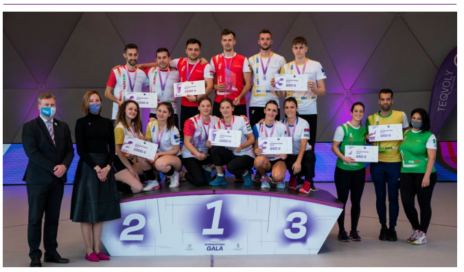
TEQVOLY BEACH GAMES VOL1 2021